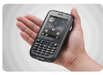
The Smallest, The Lightest